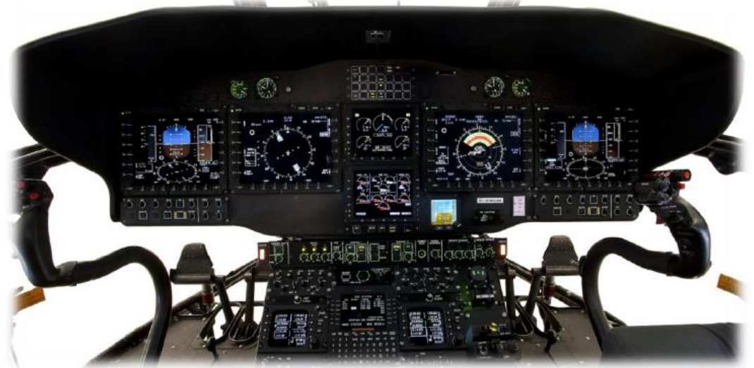
H225 last generation of avionics